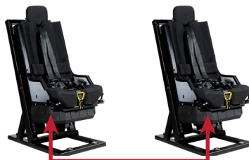
DYNAMIC MOTION SEAT SHIPSET