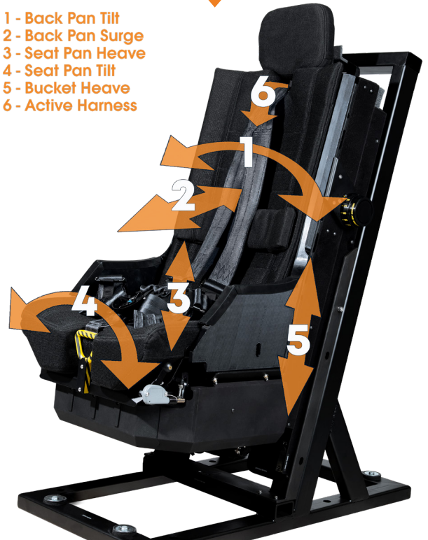
MULTIPLE MOTION CHANNELS