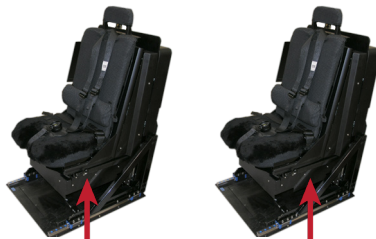
DYNAMIC MOTION SEAT SHIPSET