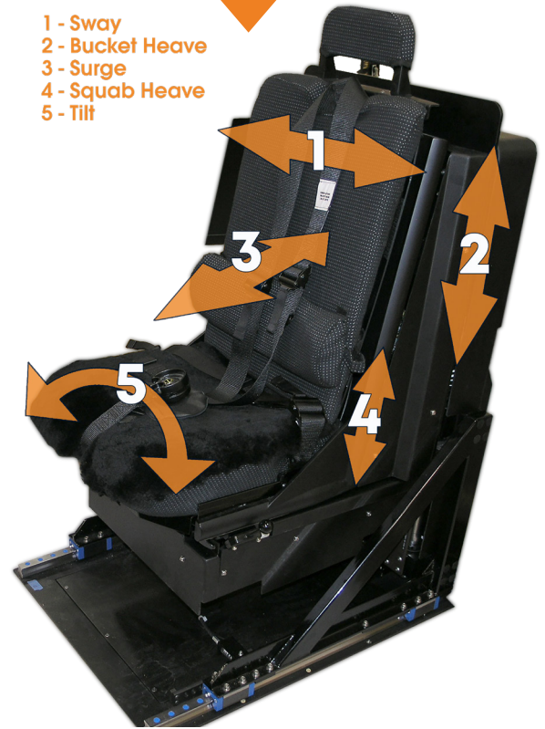
MULTIPLE MOTION CHANNELS